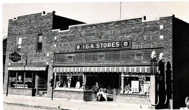
Unruh's Mercantile.