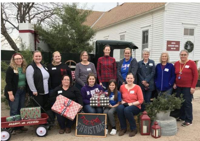
Christmas 2021 Workshop Group

Space is limited for each workshop and there is a fee. Details are available on Facebook and by contacting the museum. Gather with friends at the historic Prep School for these fun workshops. You're sure to be inspired!