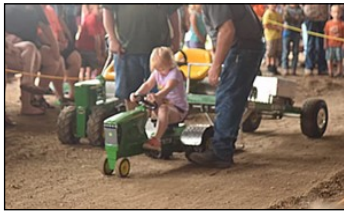
Children's pedal tractor pull and activities