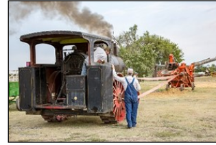
Threshing and field demonstrations

Admission charged to grounds, good all three days. Gates open at noon on Friday.