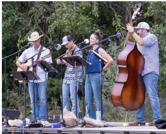
Threshing Days, continued on page 4