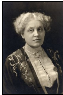
Catt in 1911